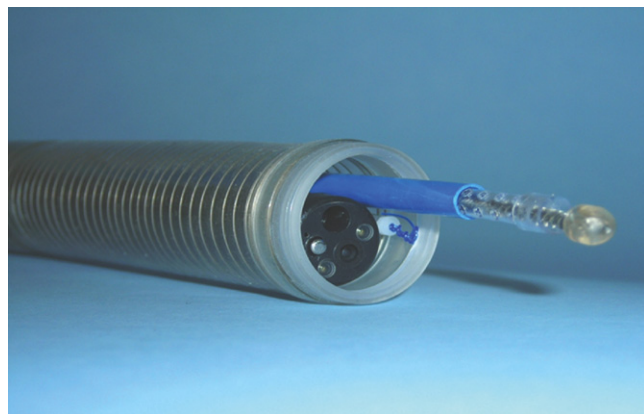
Figure 2. Colonoscopic appendectomy prototype assembly. Because of its large inner diameter, Megachannel can deliver several devices to the cecum, including the appendix-inverting device and the ligation ligature, both of which are fitted next to the colonoscope.

Possible limitations for the use of Megachannel are luminal narrowing, such as diverticular disease observed